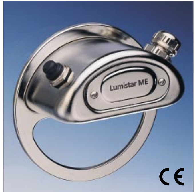
Stainless steel Lumiglas luminaire series Lumistar ME.